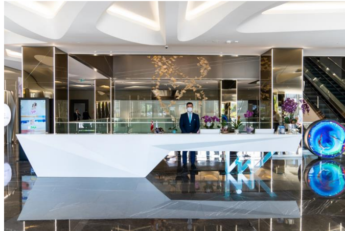
The front desk of the LIV Hospital, Vadistanbul Turkiye