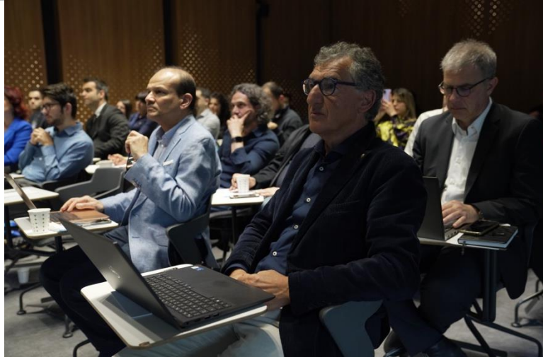
IPI faculty and attendees at the first IPI conference on 4/30/2023 in Istanbul, Turkiye